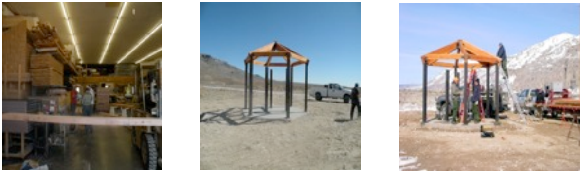
This project will be dedicated in Spring 2010