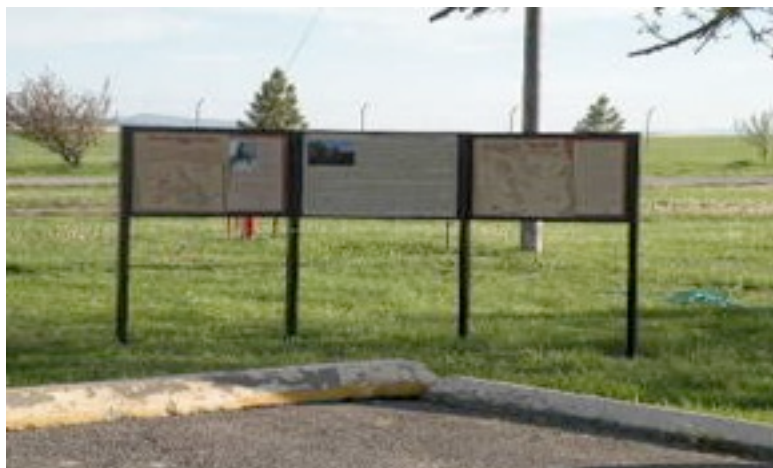
REED & BOWLES TRADING POST DEDICATION